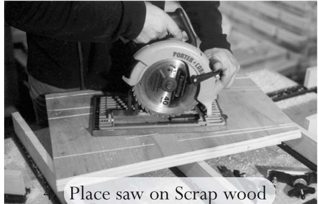
4. Place saw on Scrap wood