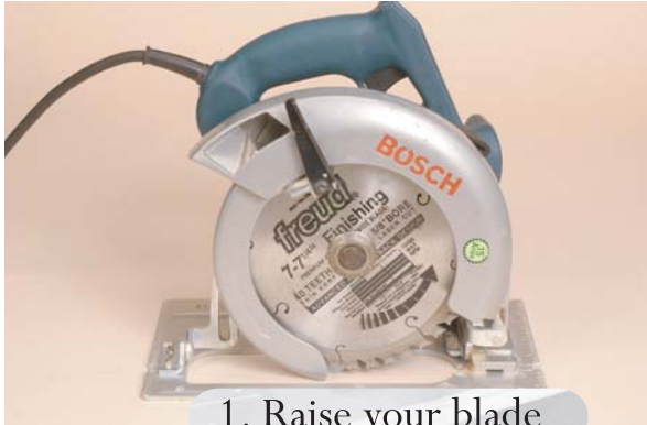
1. Raise your blade

WEAR SAFETY GLASSES AT ALL TIMES AND PLUG IN YOUR SAW ONLY WHEN YOU ARE READY TO MAKE A CUT