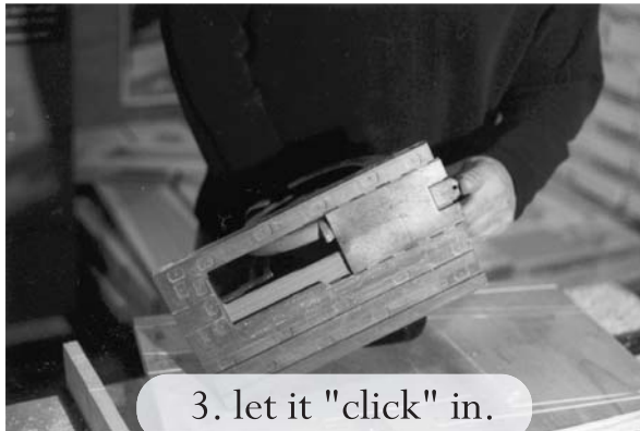
3. let it "click" in.