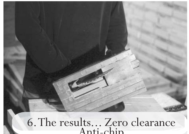
6. The results... Zero clearance Anti-chip